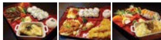
Beef Teriyaki Bento Box Chicken Teriyaki Bento Box Sashimi Bento Box