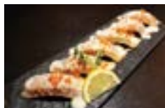
Aburi Atlantic Salmon